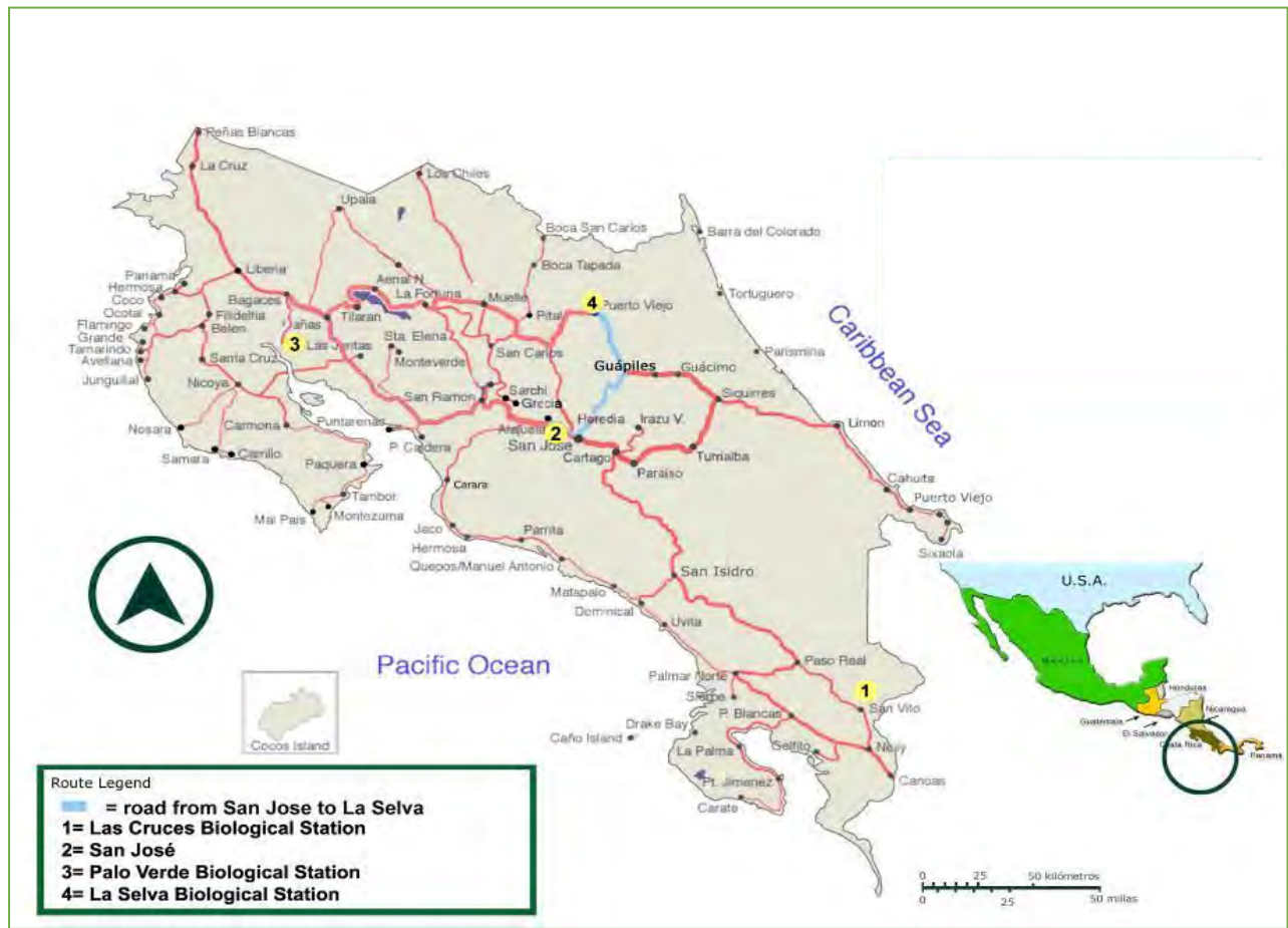
Map of Costa Rica Location of San José (country's capital) and OTS research stations.